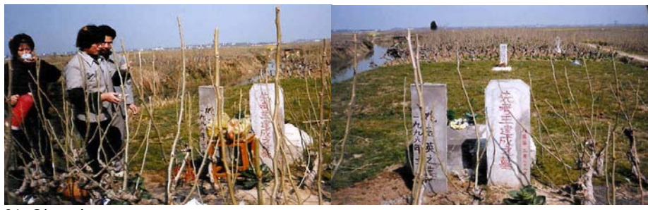
21. Qingming sweep graves