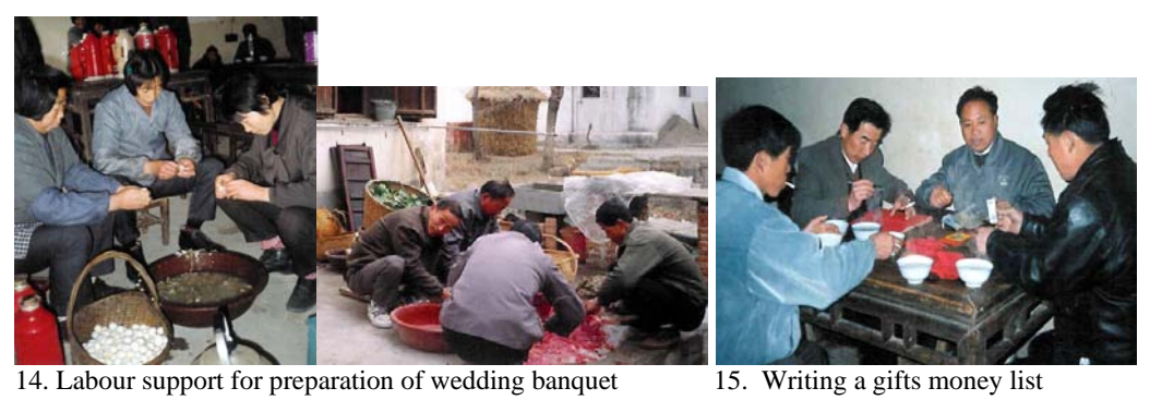
Labour support for preparation of wedding banquet 13. Writing a girts mor