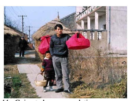
11. Going to house completion ceremony