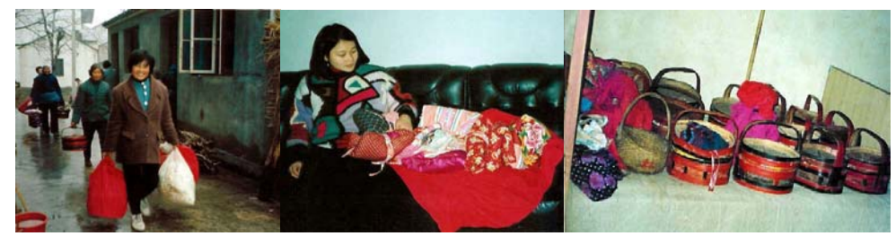
1. Natal family bring gifts for before the birth event