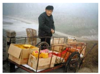
2. Lunar New Year's Day (2004)