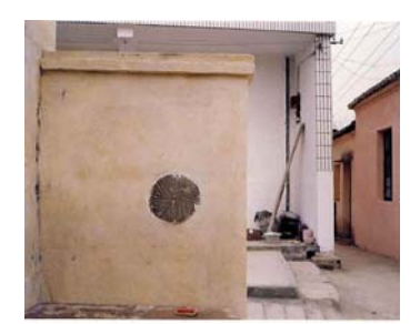
7. A solid flower pot on roof 8. A large intestine for long life of house 9. A millstone for averting evil