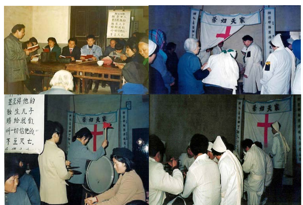
9. A Christian funeral mixed with traditional customs