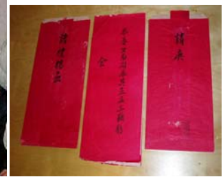
9. Big red envelopes