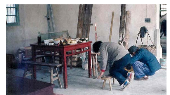
10. Ancestor worship before moving into new house