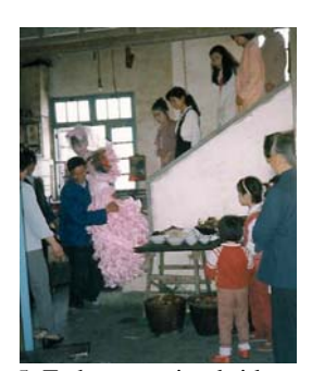
5. Father carrying bride