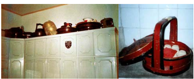
4. Gift containers on wardrobe of bridal chamber