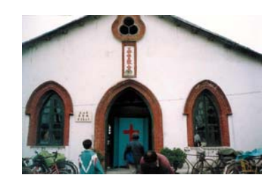
38. Zhenze Church