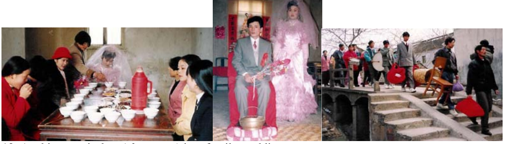
12. A taking son-in-law (zhao nuxu) into family wedding