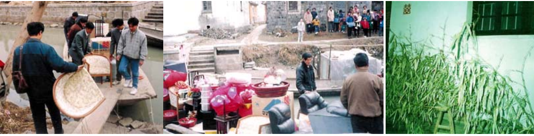
10. Loading dowry 11. Lucky bamboo