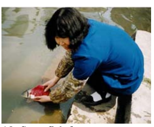
10. Set a fish free