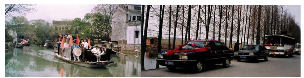
13. Welcome bride teams – either by boats or vehicles depending on the bride's family's locations