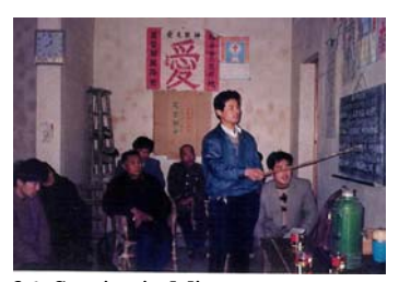
36. Service in Miaogang