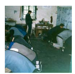
37. Pray for others