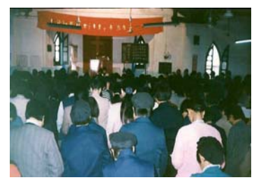
39. Service in Zhenze