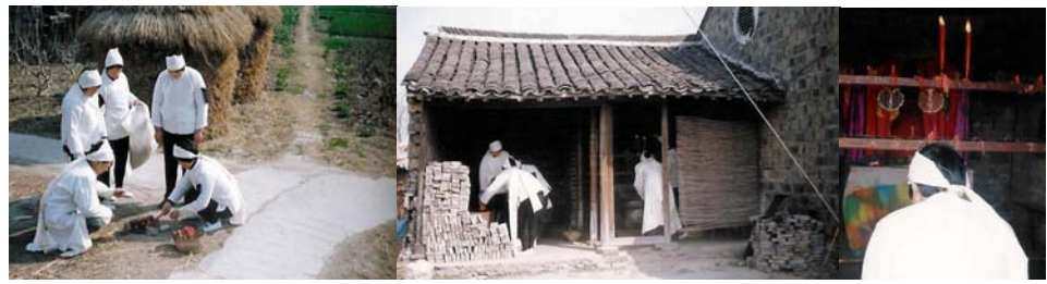
13. Do the first seventh