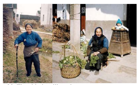
28. The elderly still work