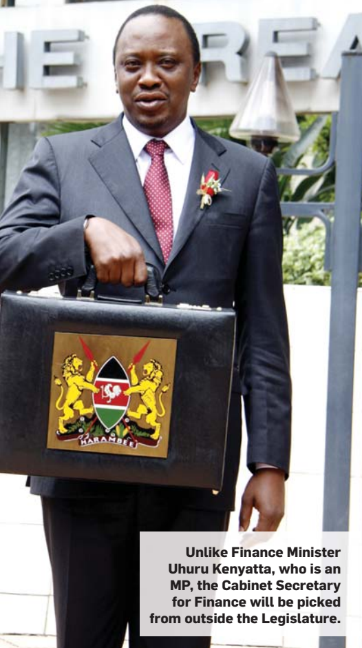
Unlike Finance Minister Uhuru Kenyatta, who is an MP, the Cabinet Secretary for Finance will be picked from outside the Legislature.

Counties will adopt their own budgets based on the revenue they raise themselves as well as their share of the revenue raised nationally, that is divided among the counties in a special County Allocation of Revenue Act.