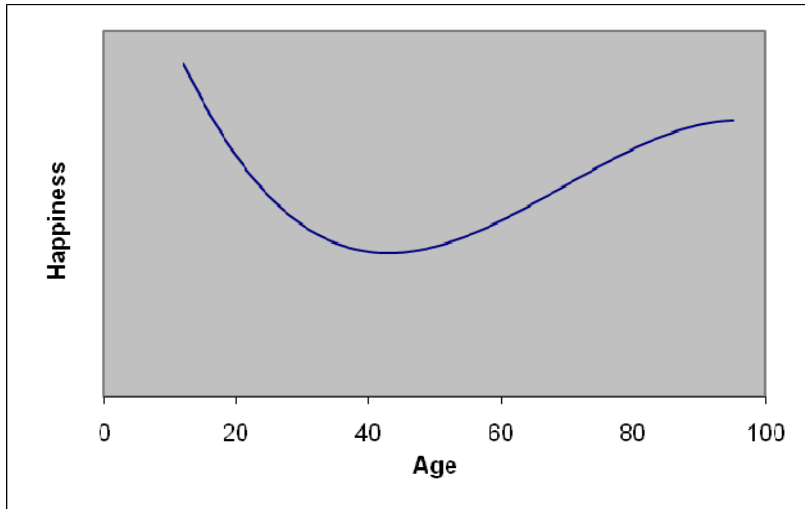
Figure 2: the estimated conditional relationship between reported life satisfaction and age

In Column (3) we introduce our noise variable, noise , to the baseline regression. Respondents who report ‘very many’ or ‘many’ reasons to complain about noise in the area where they live are much less happy than others, and this is highly statistically significant. The coefficient estimate of -0.260 is similar in magnitude to reported effects of noise on housing satisfaction by Diaz-Serrano (2006) 15 , and approximately of the same order of magnitude as the coefficient on being disabled ( \cong 0.30 ).