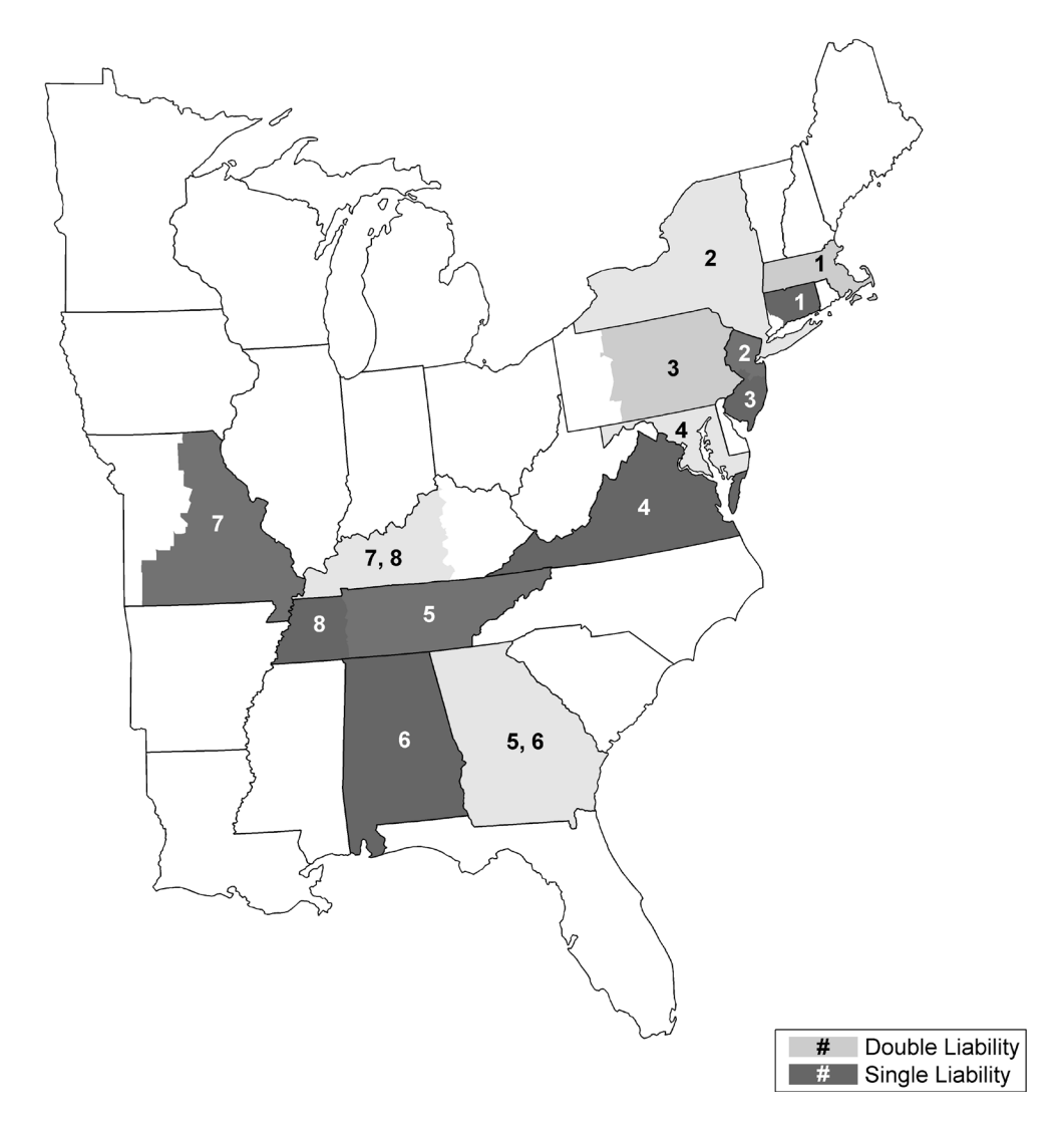
Figure 1: State-Fed district pairs

Note: The numbers identify the eight state-Fed district pairs used in the analysis. Numbers in dark font on a light background indicate districts in double liability states, while white numbers on a dark background indicate districts in single liability states. Some states, such as New Jersey, are split into two following Federal Reserve districts, with each part belonging to a separate pair. Other states, such as Georgia, serve as control for two single liability states.