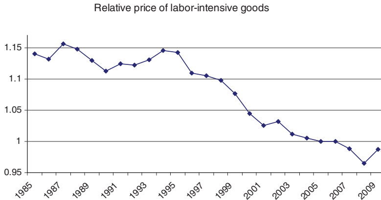
FIGURE 2. THE RELATIVE PRICE OF LABOR-INTENSIVE TO CAPITAL-INTENSIVE GOODS OVER TIME (Annually, 1985–2009)

there may be other omitted variables that are correlated with the capital-intensity of exports and also affect the current account.