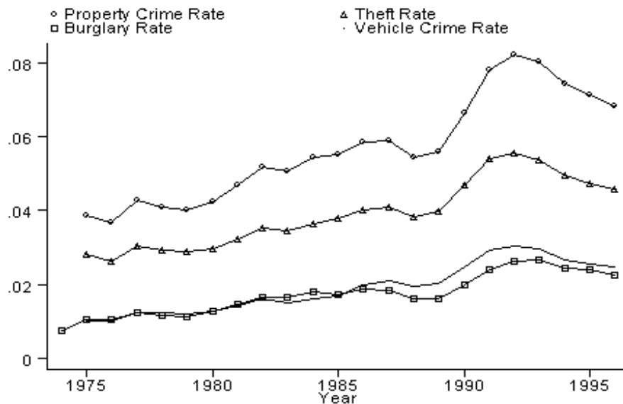
Figure 1: Property Crime Rates per person in England and Wales, 1974-96

Figure 1 reports what has happened to the property crime rate, to its components and to the vehicle crime rate between 1975 and 1996. There is a clear rise in the property crime rate, from around 38 crimes per 1000 people (.038) in 1975 up to around 68 crimes per 1000 (.068) population by 1996. Looking at the separate components reveals rather similar scale increases for theft and burglary. The same pattern, with a larger percentage rise compared to the initial level, occurs for vehicle crime, which rises from 10 crimes per 1000 to 25 crimes per 1000 between 1975 and 1996. Notice also the dip down in crime from 1992 onwards, revealing a peak in the crime rate in that year, at 80 property crimes and 30 vehicle crimes per 1000 people in England and Wales.